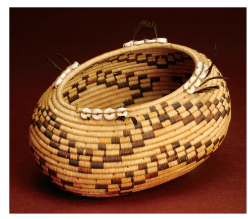
Three-Rod Coiled Boat Basket, Pomo; collections of the Grace Hudson Museum

With a strong national spotlight thrown this year on issues of systemic racism and social justice, the museum field has been taking