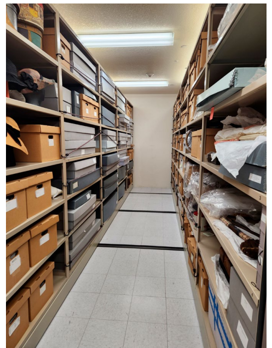
A peek inside our material culture collections vault

Hudson, each donation has its own unique paper file. Staff then creates a catalog card for each individual artifact which keeps together the donor's information with descriptions of the object—including its measurements, physical condition, and other relevant data.