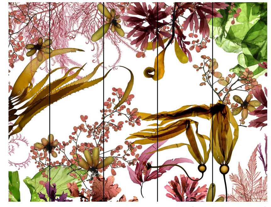
Oceans Edge I, by Josie Iselin; photographic mural (courtesy of Exhibit Envoy)

Right: Three Color Group , by Josie Iselin; archival digital print (courtesy of Exhibit Envoy)