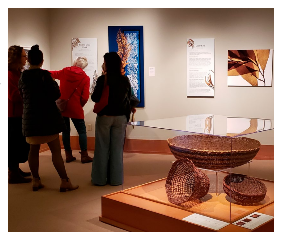
Museum visitors enjoy The Curious World of Seaweed at the opening reception.

At our February First Friday we celebrated the opening of the Museum's current exhibition, The Curious World of Seaweed , with a reception that included photographer Josie Iselin, who created the show in collaboration with Exhibit Envoy. Josie's images enchanted visitors. The addition of related pieces by local artists includ-