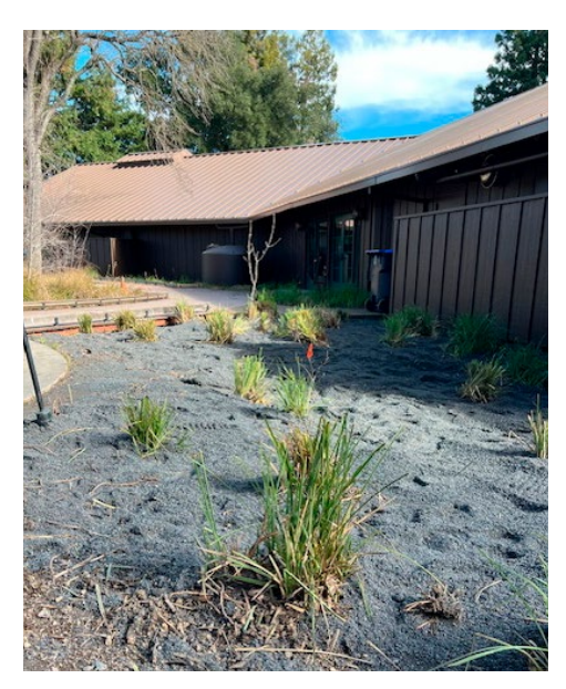
The main sedge bed after the thinning.

Recently, the Wild Gardens was fortunate to get some help from the California Conservation Corp (CCC). Four CCC members volunteered for two days to thin out the main sedge bed. White root sedge, Carex barbarae , is an important plant used in Pomo basket making. When harvested, their long white rhizomes are stripped, split, cured, and then used as the sewing strand in coiled baskets. Rhizomes are the