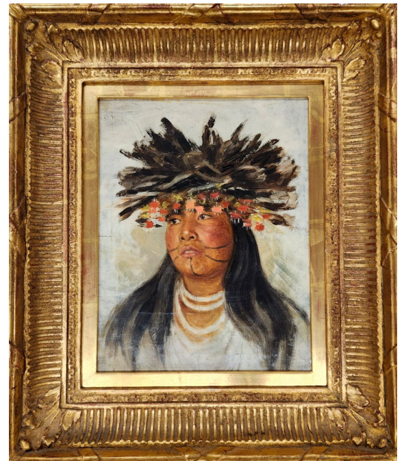
Pomo Woman with Facial Tattoos