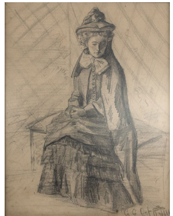
Pencil drawing of a woman by Grace Carpenter Hudson