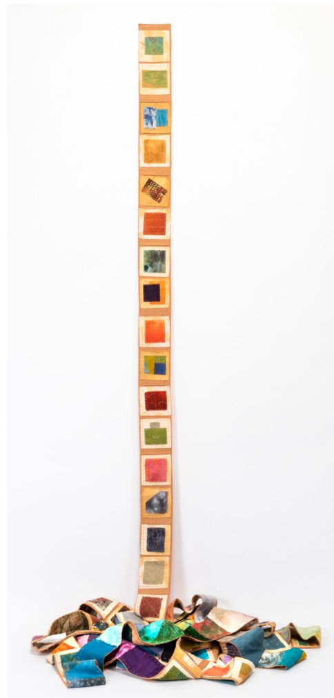
Storyline by Giny Dixon