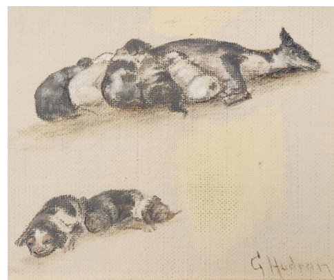
Sketch of puppies nursing by Grace Hudson